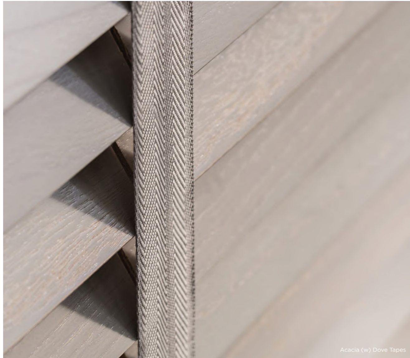
Acacia (w) Dove Tapes