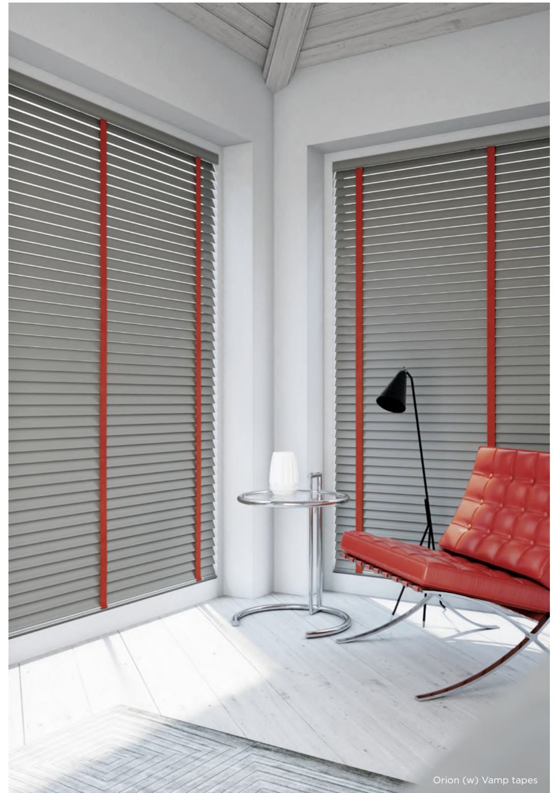
Orion (w) Vamp tapes

Emulating a sophisticated wood grain or a contemporary smooth finish, Faux Wood offers 35mm and 50mm slat widths. Crafted using high quality PVC, Faux Wood blinds are the perfect solution for areas of high moisture, such as kitchens and bathrooms.